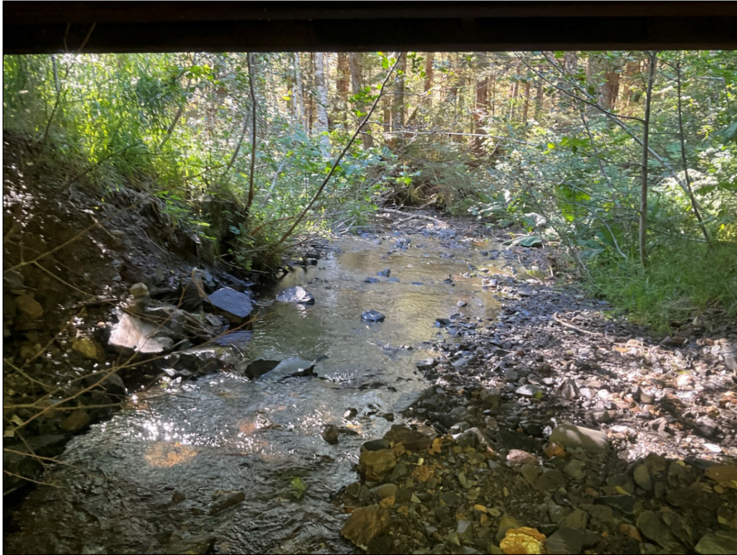
Figure 2.—Downstream view of tributary 1 from underneath bridge at waypoint 1556.