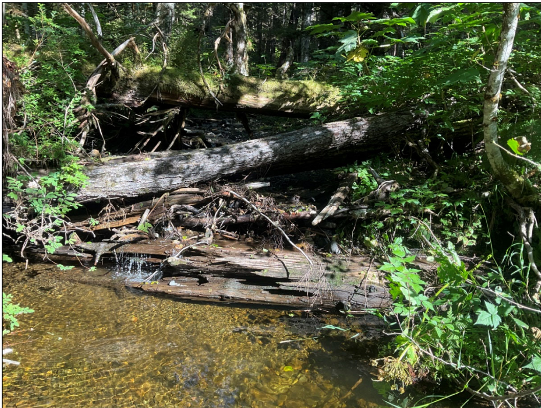
Figure 3.—Log jam upstream of bridge at waypoint 1556.