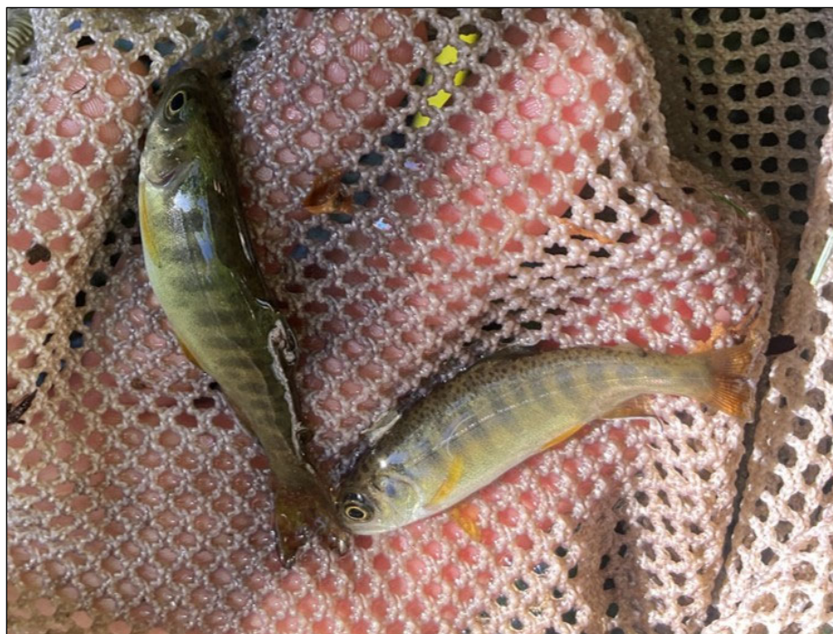
Figure 1.—Juvenile coho salmon captured at waypoint 1556.